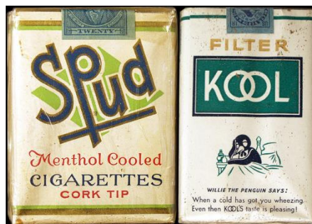
Figure 4.1 Cigarette Packs: Spud Menthol Cooled Cigarettes, 1924, and Kool Cigarettes, 1950